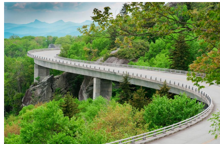
Scenic Blue Ridge Parkway