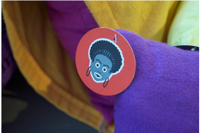
The Space Between (detail), 2012.

August 17–October 9, 2020 Marjorie Barrick Museum of Art University of Nevada, Las Vegas