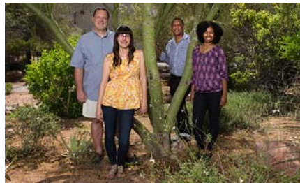
2016—2017 GPSA Executive Board. Read more about the E-Board on page 3

Much of what we do involves working with each other, assisting others, and having fun along the way. We have a lot of exciting social events planned for this semester, beginning with the annual GPSA/ Graduate College Welcome Mixer!