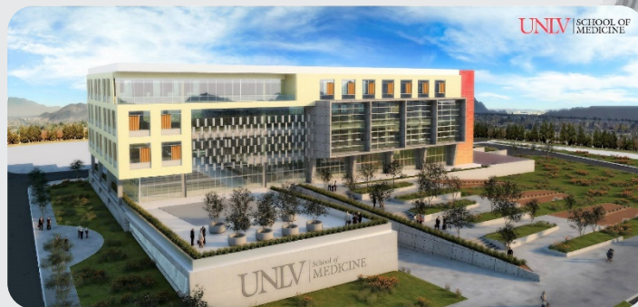
The UNLV School of Medicine is located on the UNLV Shadow Lane Campus.

As a new school that opened its doors in 2017, students are an integral part of transforming Southern Nevada's health care while propelling the School towards its mission of serving Nevada. Students participate in community service, research, and volunteer opportunities around the valley, while building national chapters of student medical organizations, along with clubs for student networking and wellness.