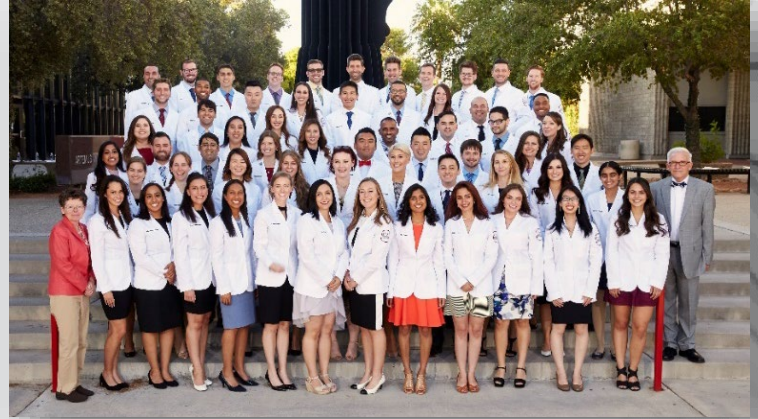
UNLV School of Medicine Charter Class