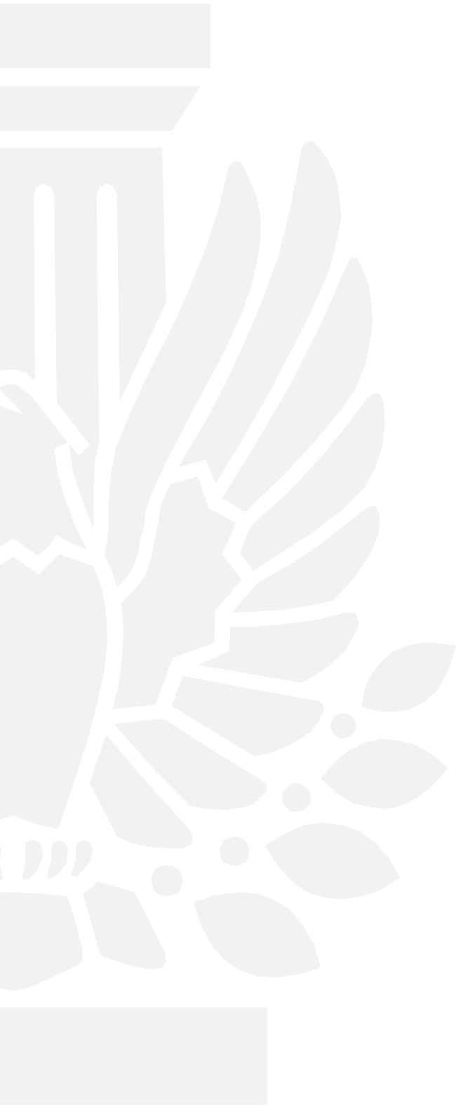
Exhibit A Scope of Work