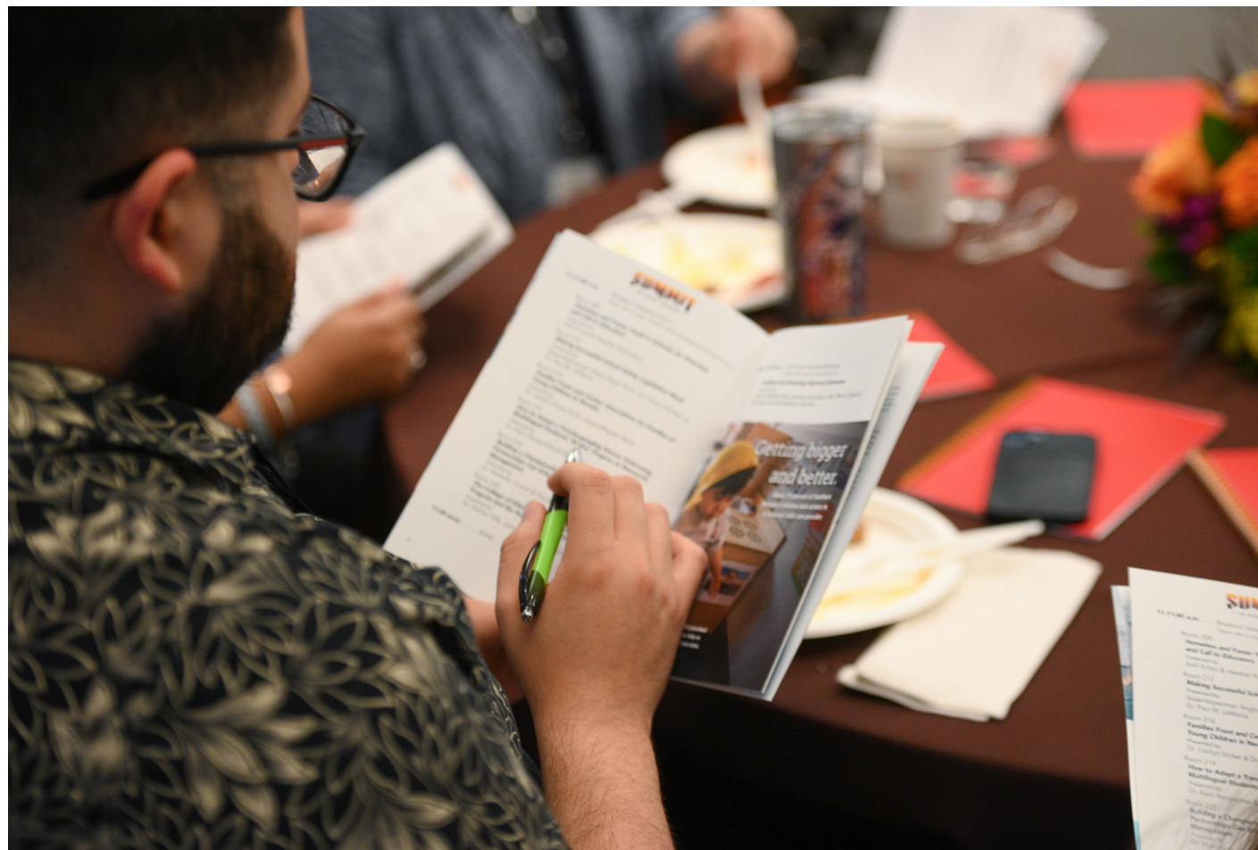
Photo 3: An over the shoulder camera shot captures an attendee reading the event program at a table after lunch. Photo 4: A person giving a presentation in front of a group of people with one of his hands in front of themselves. Their presentation is also on display behind them.