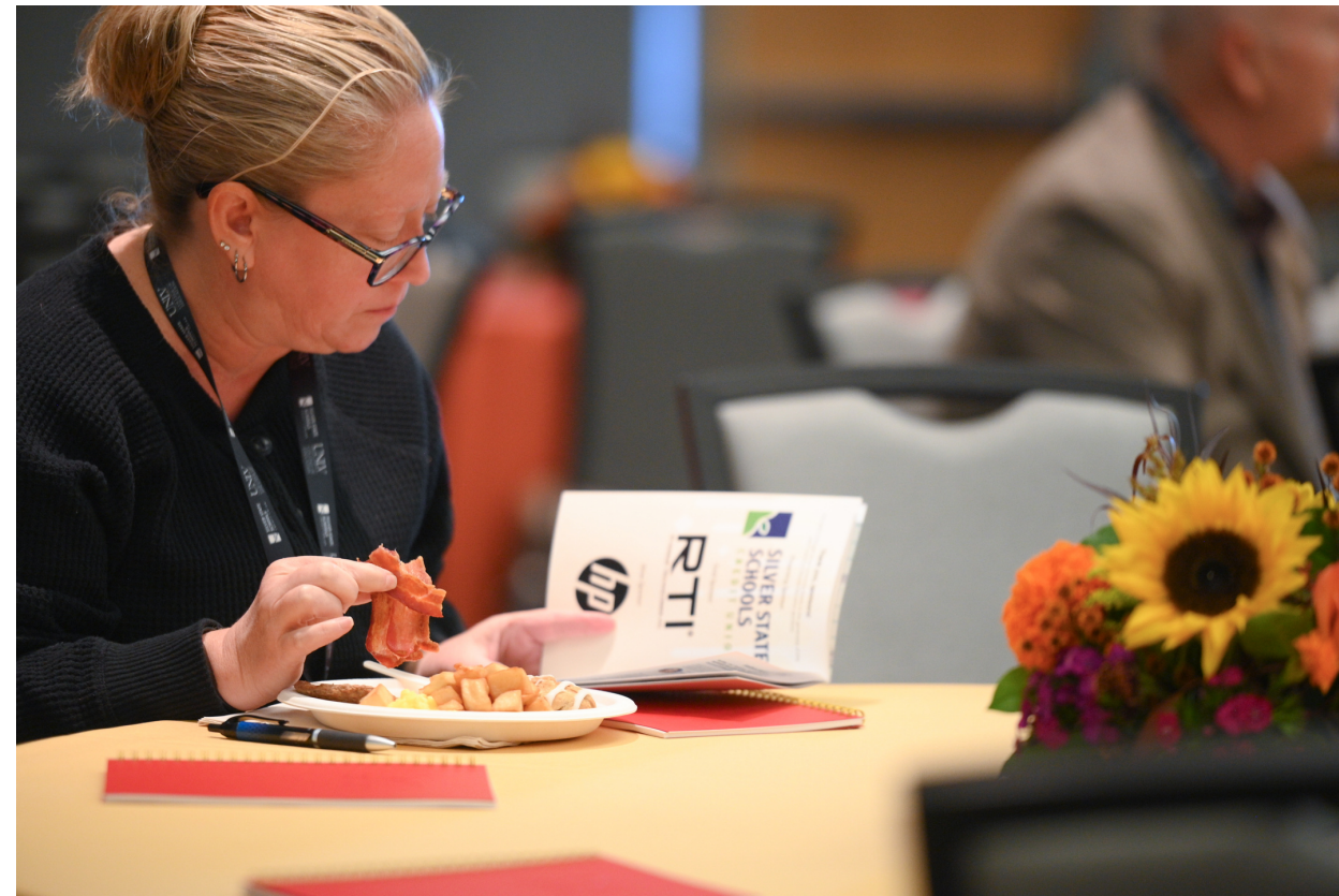
Page 7: Photo 1: A group of conference attendees participating in a breakout activity. They are standing in front of large pieces of paper taped to a wall. Some take notes and one writes on the paper on the wall. Photo 2: A summit attendee is sitting at a table. They have a plate of food in front of them, and reading the event program.