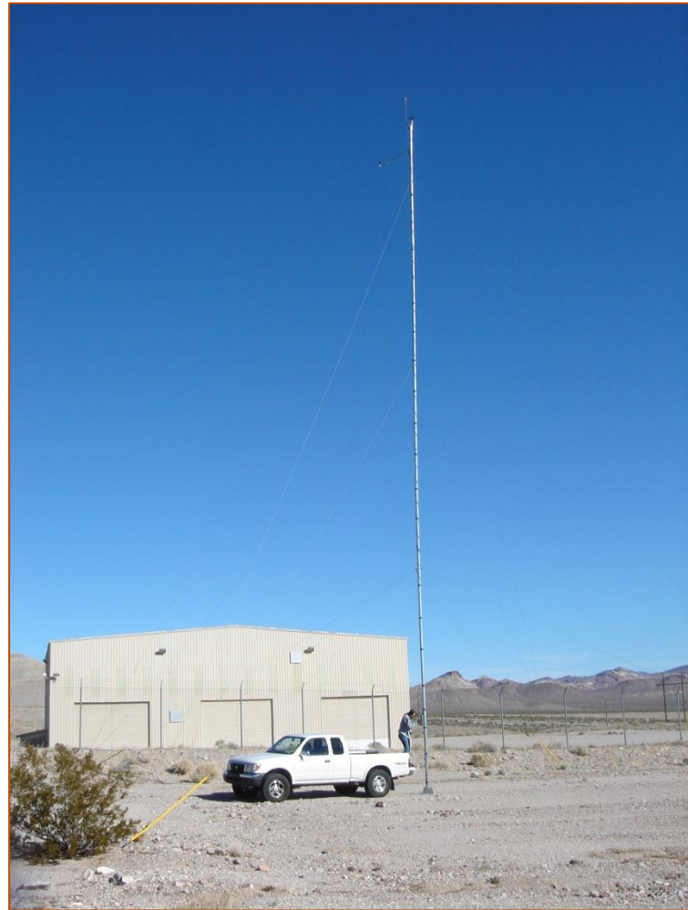
The Mine Parking Lot wind-generation test site.

Yitung Chen, Ph.D. Phone: (702) 895-1202 Email: yitung.chen@unlv.edu