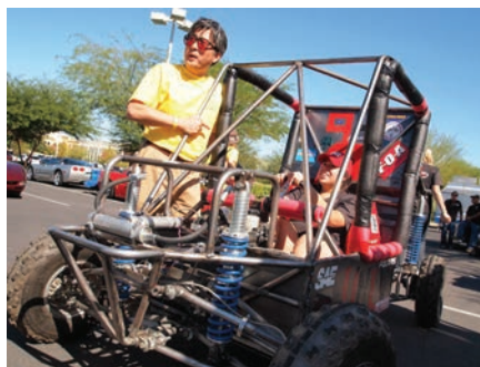
UNLV's Society of Automotive Engineers student chapter's competition vehicle.