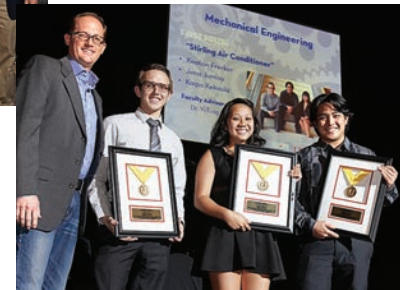
"Stirling Air Conditioner" takes first prize in the mechanical engineering category at the spring 2013 Fred and Harriet Cox Senior Design Competition.