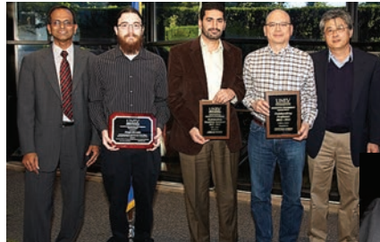
Mechanical engineering department award winners at the 2013 College of Engineering Honors Convocation.