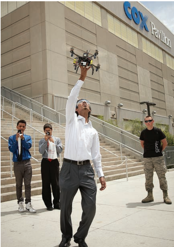
The "Variable Pitch Quad Rotor Kopter" is featured at the spring 2013 Fred and Harriet Cox Senior Design Competition.

It is the mission of the department of mechanical engineering to prepare students for the lifelong practice of mechanical engineering and related engineering disciplines. This includes preparation for immediate entry into positions in industry or for further study in graduate school. Additionally, the department sustains an outstanding academic program, motivating the faculty to attain excellence in research by acquiring external funding and incorporating students into their research programs.