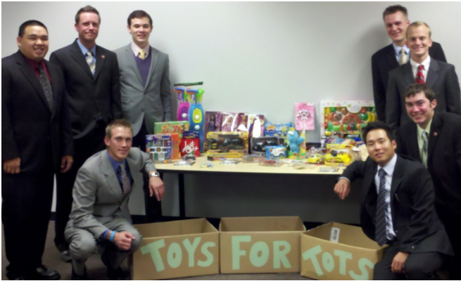
Pictured above: Members of the PGASA Executive Board