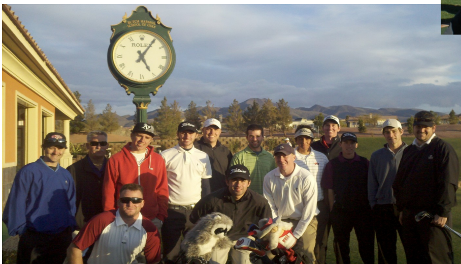
PDP students after a short game clinic at the Butch Harmon School