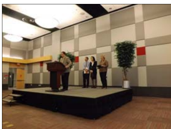
GPSA 2012-2013 GPSA Service Award winners

The GPSA recognizes students and faculty from across disciplines and classifications for their contributions to the development and continuing growth of UNLV. The four categories are: Outstanding Mentor Award, Service Award, Merit Award and Distinguished Contribution Award. Learn more about how to nominate a deserving student or faculty member: http://gpsa.unlv.edu/grants/ . Application deadline is December 7, 2013 .