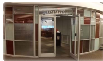
Graduate Student Commons located on the 2nd floor of the Lied Library