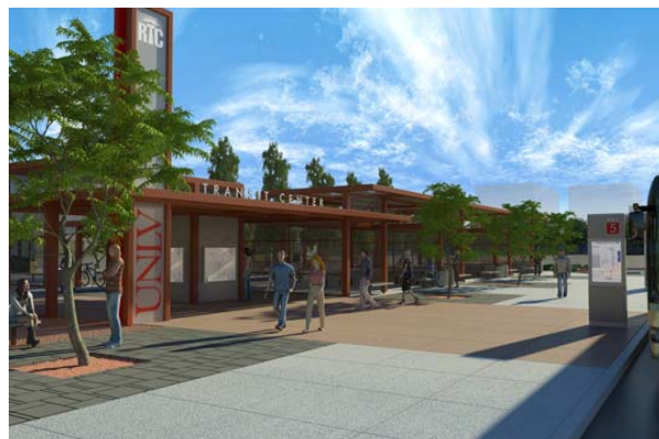
Rendering of UNLV's new Transit Center

Construction began mid spring 2013 on campus for a new Transit Center. Located near the Greenspun Hall Building, right behind the In-and-Out Burger, the 6,460 square foot Center is scheduled to open fall 2013. Students, faculty and staff will be able to purchase discounted passes on all Regional Transportation Routes (RTC). This exclusive UNLV discount offers monthly passes for $32.50 regularly $65.00 (50% savings) and semester passes for $104.00 (60% savings). The passes will be available for sale at the UNLV Student Union and the Parking and Transportation Service Office. The Transit Center is part of UNLV's master plan and is a multi-modal facility. It will support facilities, services and connectivity for public transit, pedestrians and bicyclists.