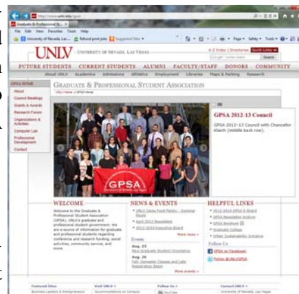
This summer the GPSA website got a new look.