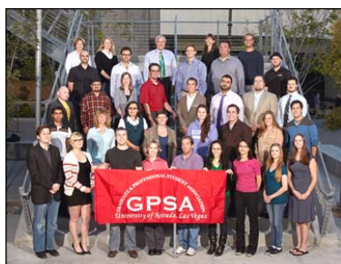
GPSA Council 2012-2013