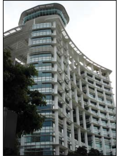
The National Library of Singapore will house UNLV Singapore.

Construction of UNLV Singapore is set to be completed in May. A grand-opening celebration is scheduled for August 2006. For more information about enrollment, visit www.unlv.edu.sg .