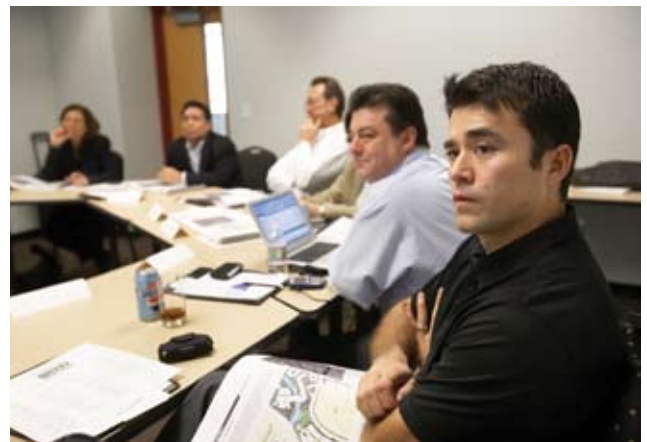
Members of the INNnovation Village advisory group discuss the project.