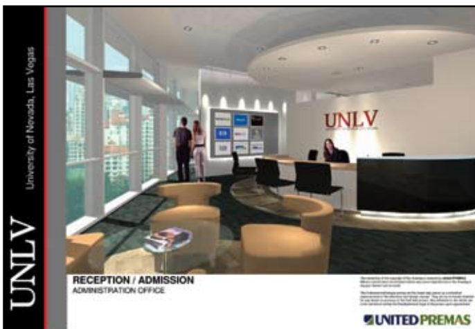
Rendering of UNLV Singapore reception area.