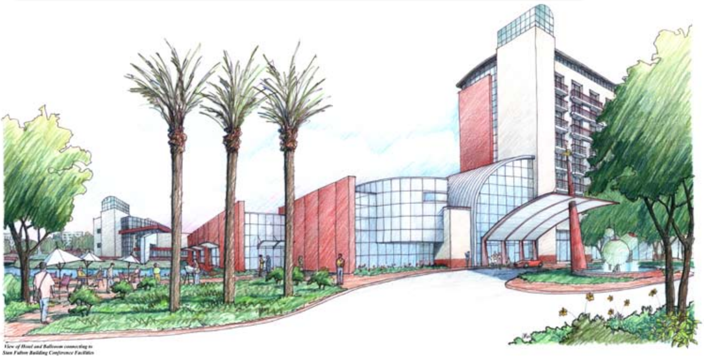
View of Hotel and Ballroom connecting to Stan Fisher Building Conference Facilities

U N L V H a r r a h H o t e l C o l l e g e