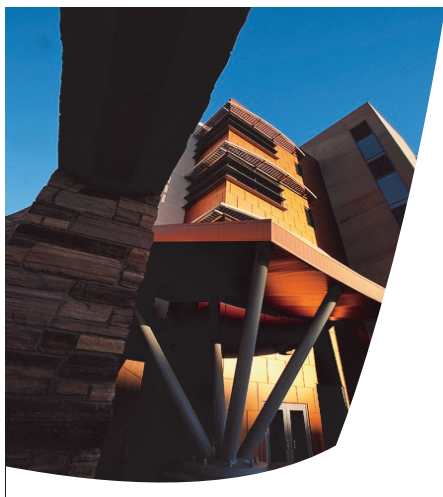
UNLV Science and Engineering Building