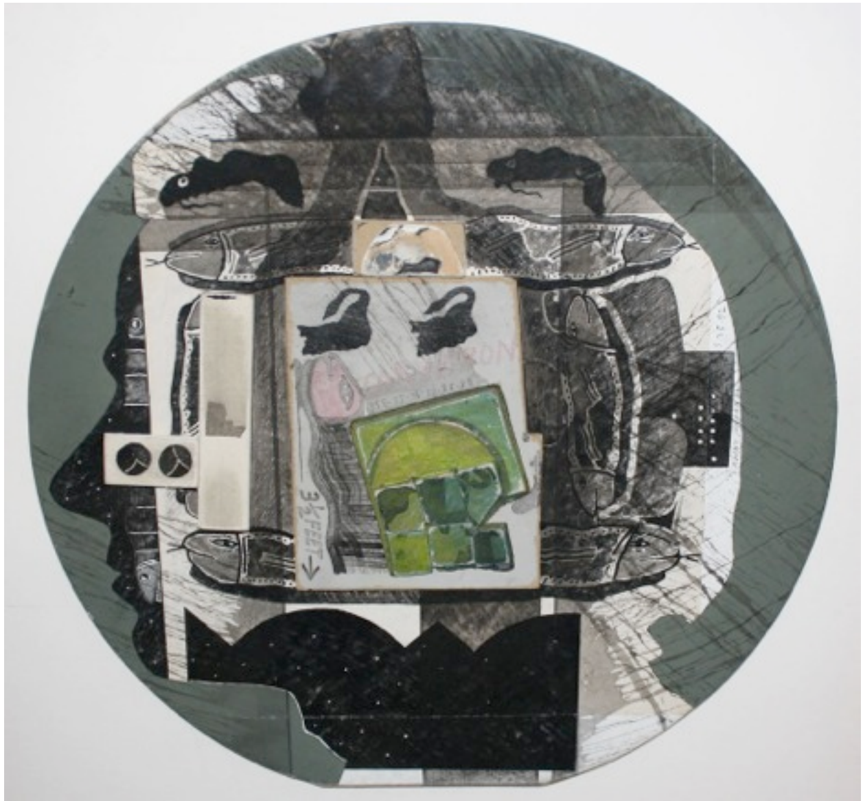
2 Yellow Green, Ray Johnson, 1959-75-76-77-88-89 Collage on corrugated cardboard