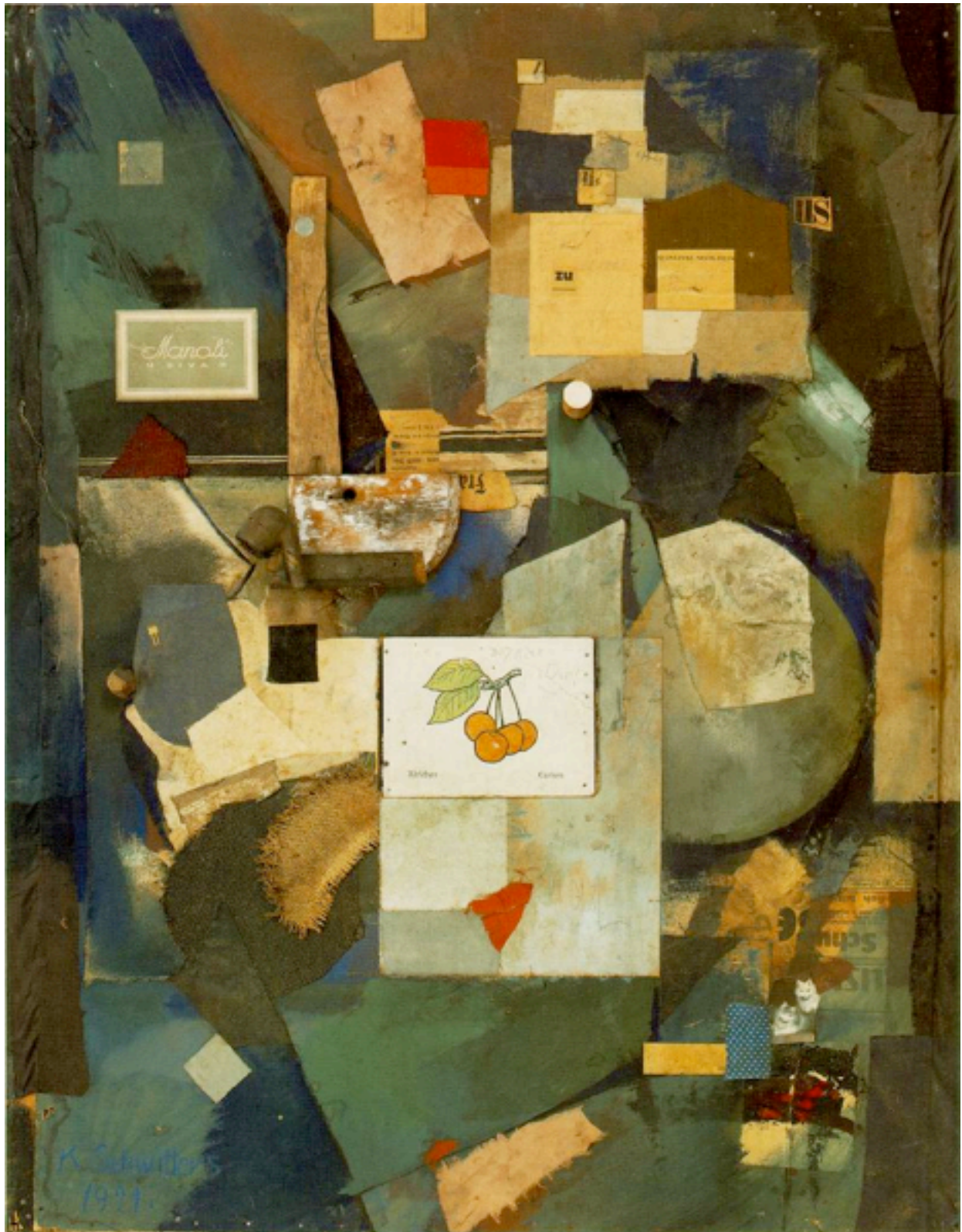
Merz Picture 32 A. The Cherry Picture , Kurt Schwitters, 1921 Cut-and-pasted colored and printed paper, cloth, wood, metal, cork, oil, pencil, and ink on paperboard