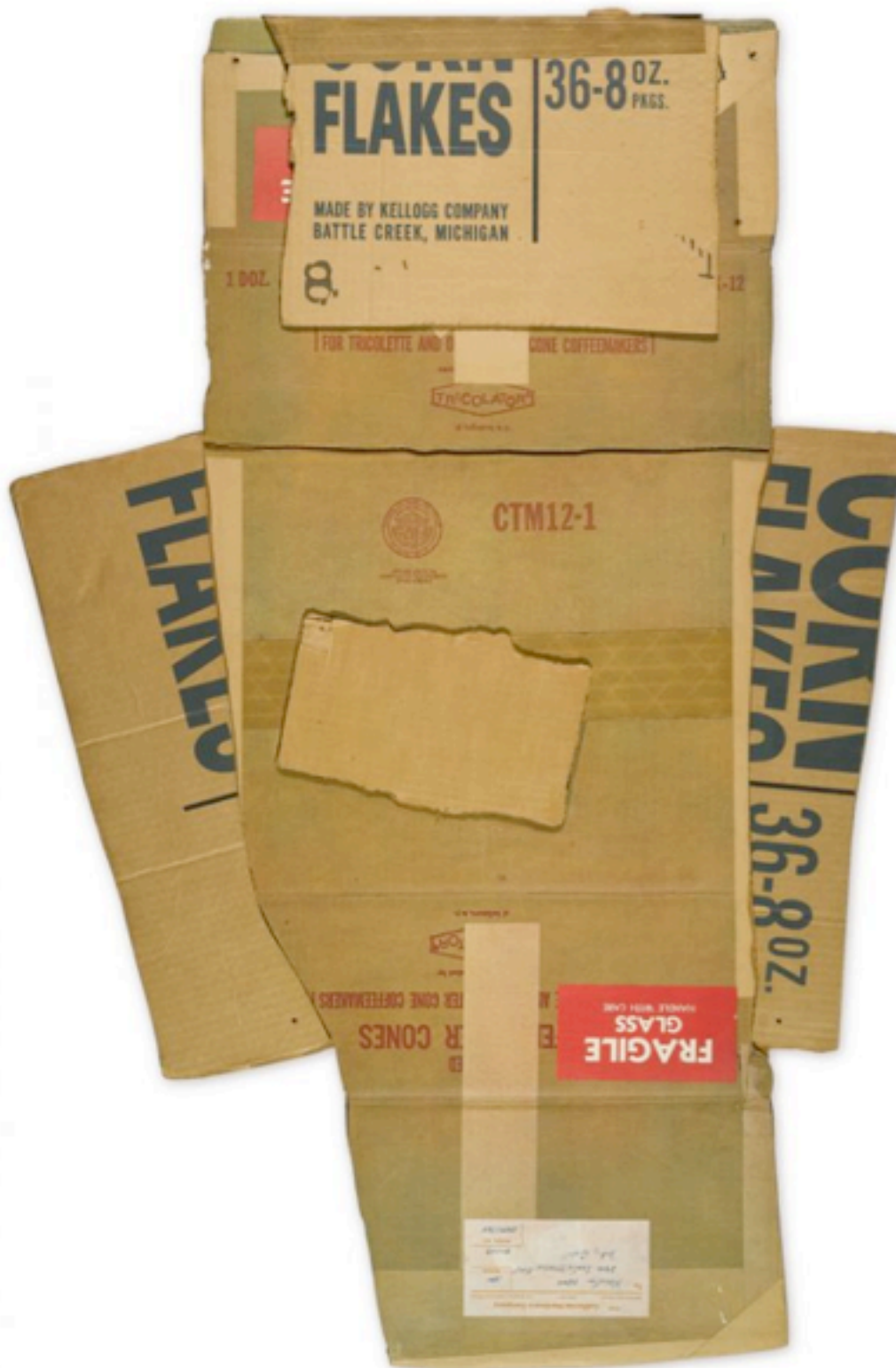
Cardboard Series , Robert Rauschenberg, 1971 Cardboard